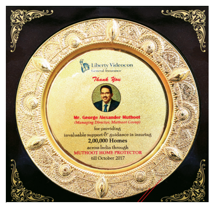
Muthoot Insurance Brokers awarded by Liberty General Insurance for covering 2,00,000 homes through Muthoot Home Protector